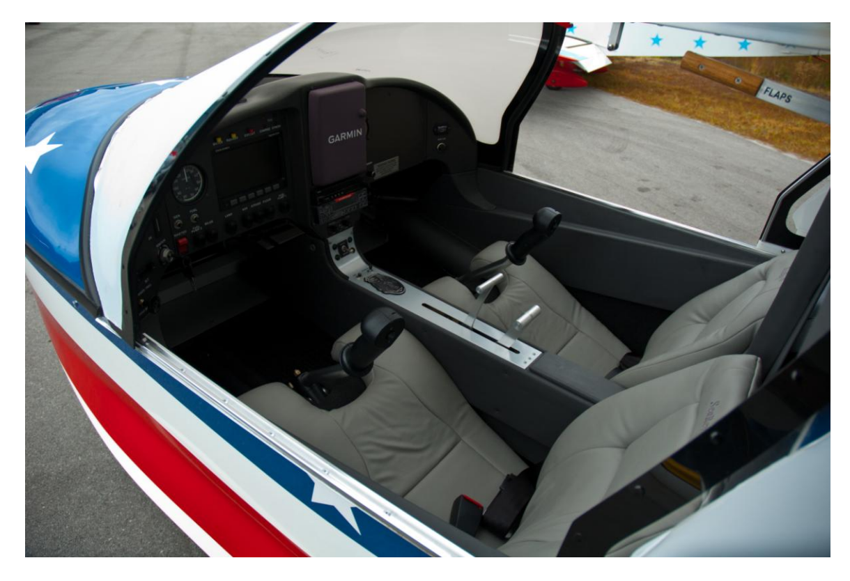
Cockpit is wider than Cessna 172 but leg room is a little limited